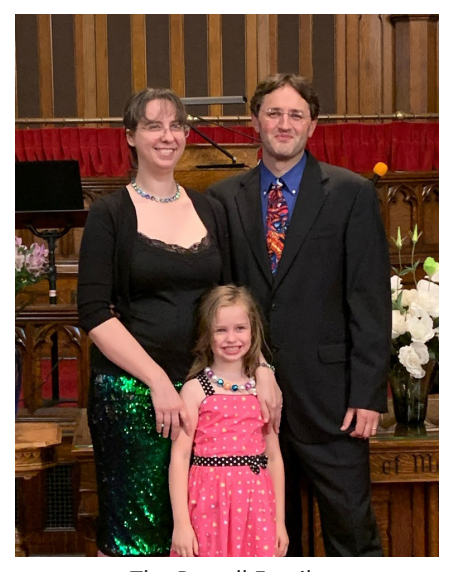
The Powell Family

Statistics about the Global Church are useful, they paint a two-dimensional picture, but actually standing in the midst of men and women from all over the world to whom Jesus Christ is Lord and Savior, all as eager to learn about the places he visited as we were, really drives home in a powerful way the wondrous breadth of the universal Church.